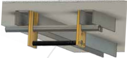
Not a supporting means. Clamps still required.